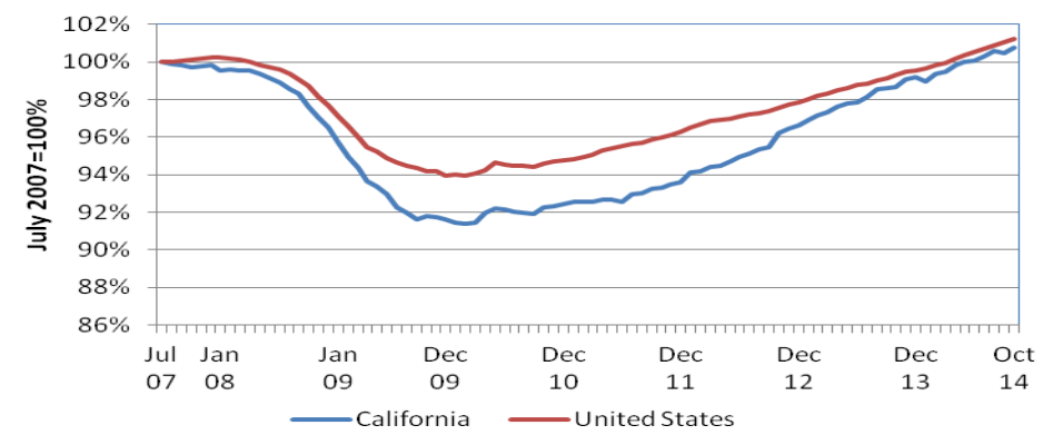
Job Trends: Recession and Recovery

Payroll job growth continues to slightly outpace the nation with a year over year gain of 2.1% in California compared to 1.9% in the nation. The strongest sectors over the past 12 months were construction (+5.3%), professional and business services (+4.5%) and information, which includes Internet services (+3.9%).